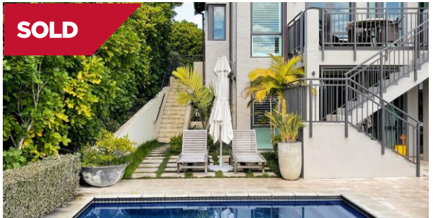
Remuera/Auckland 56C Arney Crescent

wall, this beautifully presented villa combines timeless character with modern convenience and easily accessed three-car garaging.