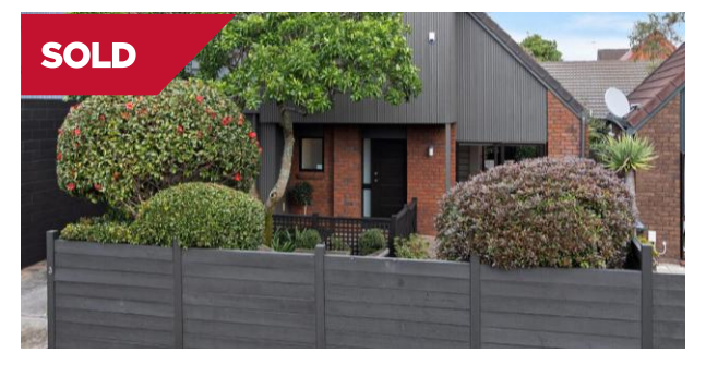
Mount Eden/Auckland 3 Balmer Lane