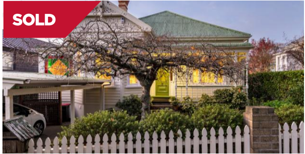
Mount Eden/Auckland 68 Saint Leonards Road

This home combines urban vibrancy with privacy, featuring bi-fold doors that open to a sunny, secure courtyard and garden for entertaining.