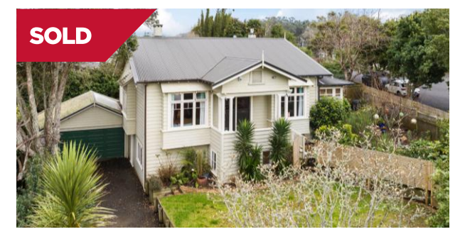
Epsom/Auckland 3 Woodhall Road

This sought-after Paddington Green townhouse offers a freehold site with brick and cedar construction, recent refurbishments, and a stylish new kitchen, combining functionality and modern design.