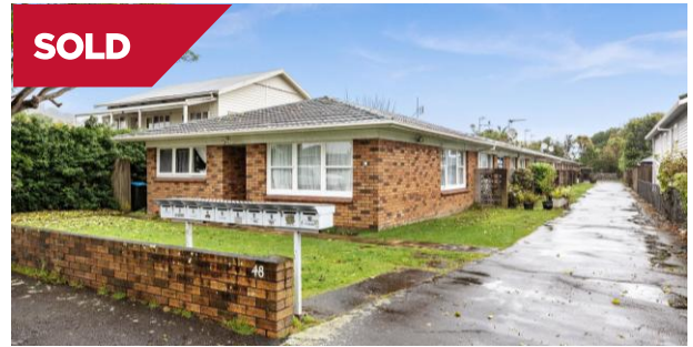
Mount Eden/Auckland 4/48 View Road

Beautifully renovated and north-facing, this 1930s family residence features stylish living spaces, private decking, level lawns, and a mature garden, perfectly designed for both relaxation and entertaining.