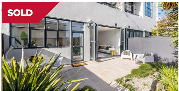
Grey Lynn/Auckland 2/19 Crummer Road

This spacious 1970s brick and tile unit in Mt Eden offers two large bedrooms, one bathroom, and a well-insulated ceiling, providing comfort and convenience for modern living.