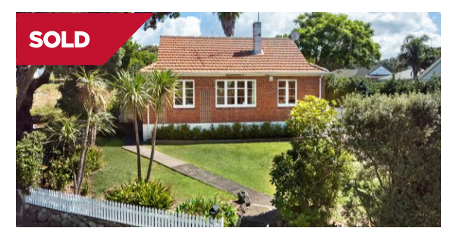
Onehunga/Auckland 46 Oranga Avenue