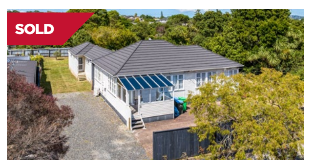
Avondale/Auckland 4 Miranda Street

This colonial homestead on approximately half an acre of prime land is ideal for a multi-unit development or to restore the home to its former glory.