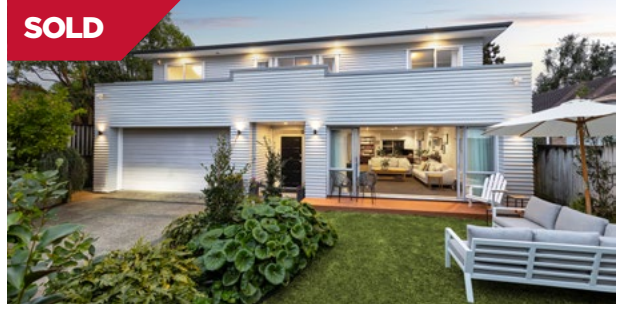
Sandringham/Auckland 24A Hazelmere Road