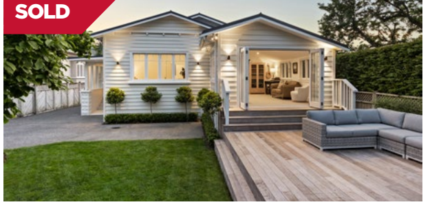
Mount Eden/Auckland 29 Croydon Road