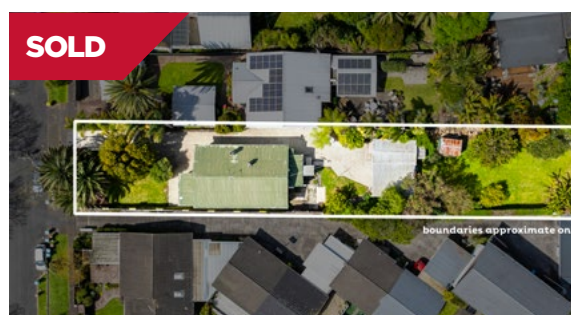
Mount Eden/Auckland 10 Telford Avenue