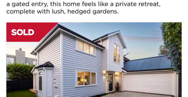
Mount Eden/Auckland 2/22 Herbert Road

those seeking a home plus an income opportunity.