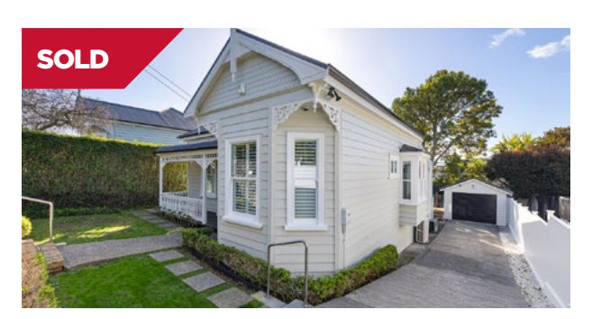
Mount Eden/Auckland 18 Milton Road

Owned by the current family for over 50 years, this much-loved family home, on a large flat section, now offers a prime opportunity for those looking to take an untouched classic and make it their own.