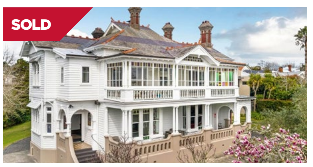
Herne Bay/Auckland 60 Argyle Street

With its west facing gorgeous flat lawn and covered entertaining deck you literally only share it with the Tuis and the sunsets. It's private, quiet and in a great community with likeminded neighbours.