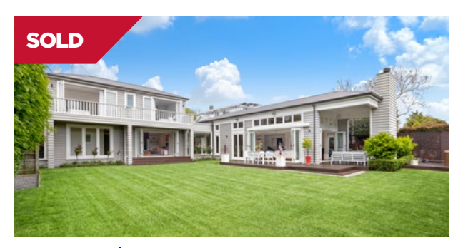
Mount Eden/Auckland 20 Woodside Road