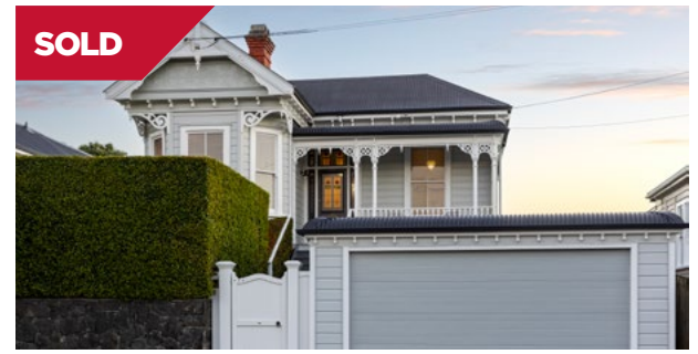
Mount Eden/Auckland 49 Milton Road

This modernised, three bedroom, 1950s, weatherboard bungalow has a consented one bedroom flat/minor dwelling attached and will have immediate appeal to savvy homebuyers and investors alike.