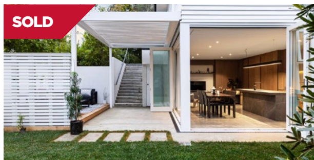
Remuera/Auckland 60 Waiatarua Road

Redesigned by Macintosh Harris, this gorgeous villa offers a fabulous lock up and leave lifestyle. Superbly located in the Double Grammar Zone, a short walk to the delights of Newmarket shops, restaurants and train.