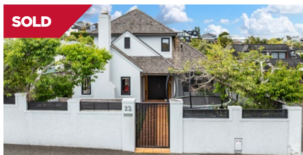
Kohimarama/Auckland 22 Sage Road