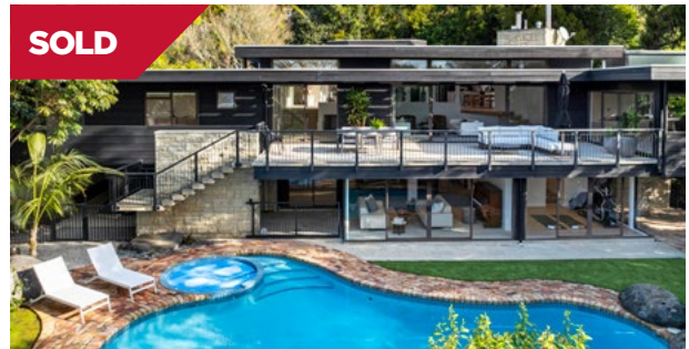
Sold Remuera/Auckland 17 & 21 Waiata Avenue

A rare find in a coveted Bays' neighbourhood, this expansive 1,027 sqm, more or less, property offers the perfect setting for summer fun and family living.