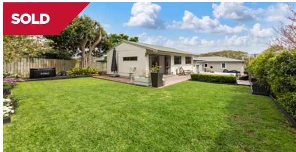
Sold Glendowie/Auckland 21 Aragon Avenue

Discover an extraordinary private retreat hidden in the heart of Remuera - where the rare opportunity to own over 4,600sqm, of north-facing, beautifully landscaped grounds awaits.