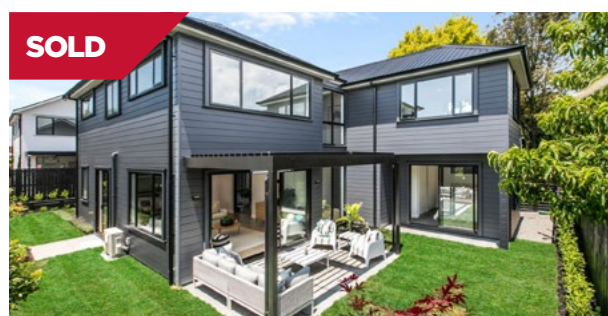
Glendowie/Auckland 52B Kesteven Avenue

This striking, upbeat, architecturally designed home built new in 2020 captures the essence of modern living. The layout is expansive and the location, in this quiet north facing cul-de-sac, sought after.