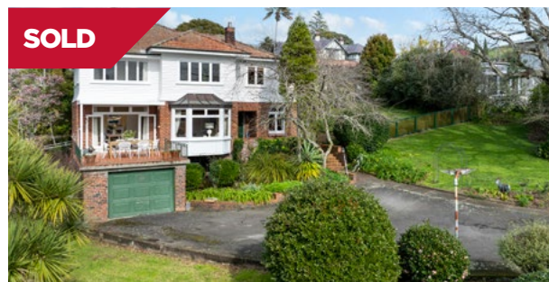
Remuera/Auckland 63 Portland Road

This architectural redesign is a testament to transformation. Originally built in the 60s, the property looks over to beautiful native bush, enjoying the abundance of native birdlife that fills the area.