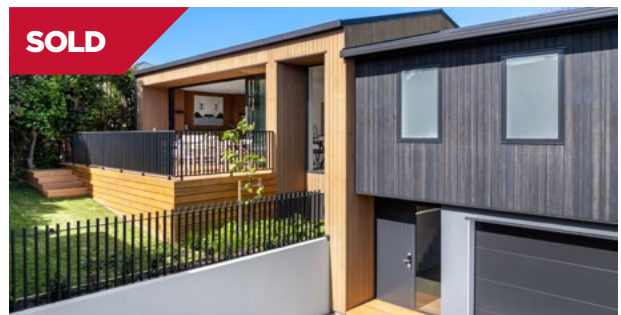
Sold Glendowie/Auckland 79B Kildare Avenue

This beautiful weatherboard family home is a rare find, seamlessly blending classic charm with modern open plan living. Combining a large sunny flat backyard, pool, lawn, mature trees, and fabulous indoor/outdoor flow.