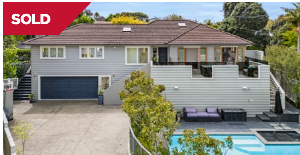
Sold Saint Heliers/Auckland 62 Edmund Street