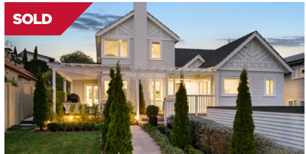
Sold Saint Heliers/Auckland 18 Brilliant Street

This beautifully presented, 1950s, weatherboard, family home has fantastic indoor/outdoor flow, with large decking, a swim spa and a flat lawn. Liveable as it is, there's also plenty of potential to add value over time.