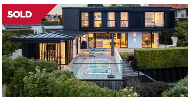
Orakei/Auckland 8 Puna Street

Stately, enduring and timeless, such are the characteristics of this imposing brick and weatherboard two storey residence on a substantial plot of 1,260sqm, more or less, of freehold land.