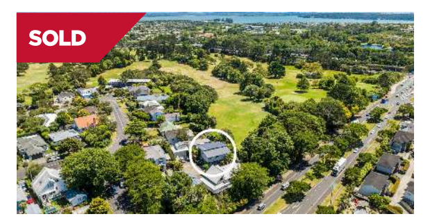
Mount Albert/Auckland 78 Linwood Avenue