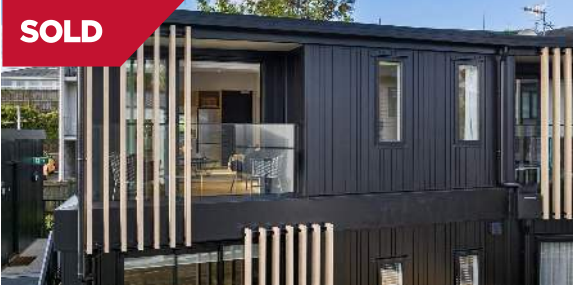
Mount Eden/Auckland View Road