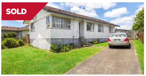
Henderson/Auckland 15 Penfold Place