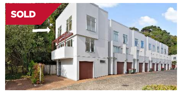
Three Kings/Auckland 46/852 Mount Eden Road