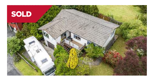
Titirangi/Auckland 14A Pokapu Street

These 2 three bedroom homes, generating a solid return of $1,060 per week, present a lucrative investment opportunity or ideal entry point for first home buyers.