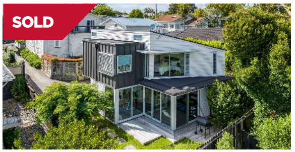
Western Springs/Auckland 52A Finch Street