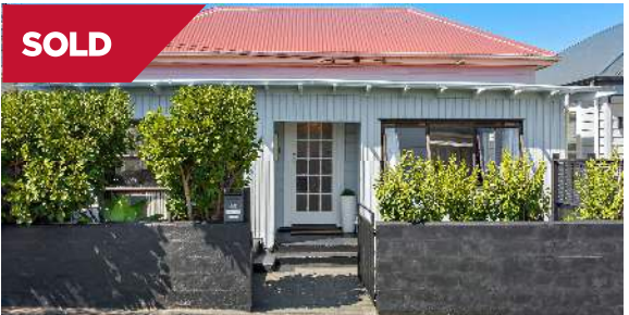
Grey Lynn/Auckland 40 Rose Road