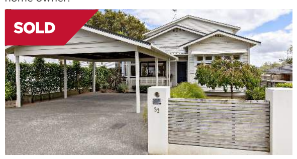
Western Springs/Auckland 52 Finch Street

If your new year's resolution included home ownership, this four bedroom home is a real option. Situated on a large level site in this quiet cul-de-sac.