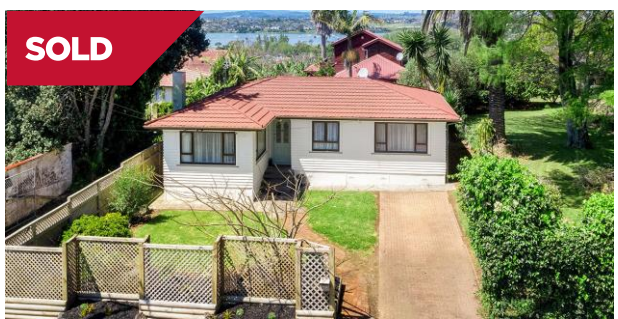
Panmure/Auckland 32A Court Crescent