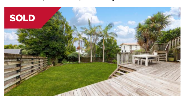
Saint Heliers/Auckland 7 Bermuda Road

This charming, upgraded 2023 weatherboard home offers Santorini-inspired aesthetics, stunning Tamaki River views. Perfect for families seeking a lowmaintenance, coastal-inspired lifestyle.