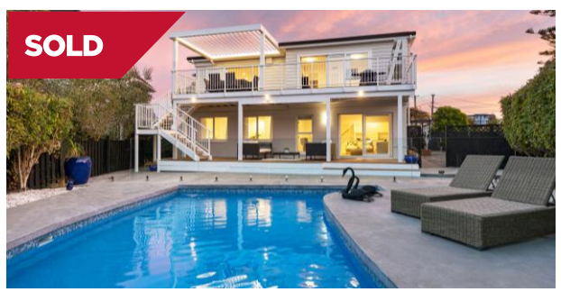
Mission Bay/Auckland 8 Palmer Crescent