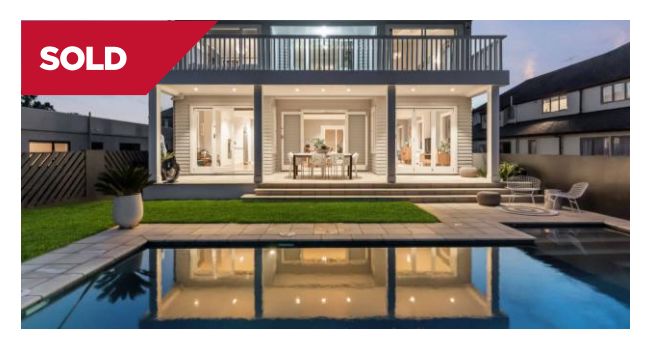
Eastern Beach/Auckland 1/11 The Esplanade

Family-friendly and sunlit, this renovated home offers a crisp white kitchen, spacious living areas, and a poolside retreat. The downstairs suite adds flexibility for guests or extended family.