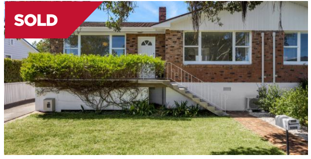
Glendowie/Auckland 1/315 Riddell Road

This renovated unit boasts double glazing, private courtyards, and Sandringham-border convenience. A superb opportunity for downsizers, professionals, firsthome buyers, or investors prioritising quality and location.