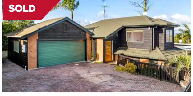
Glen Innes/Auckland 3A Lintaine Place

This two-bedroom brick unit combines modern living with practicality. Featuring a private backyard, polished floors, and basement storage, it's close to nature reserves, cafes, and top schools, making it a versatile choice.