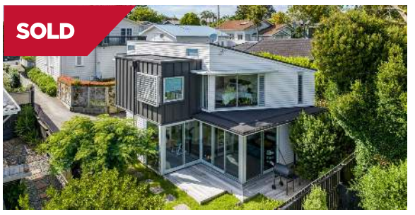
Western Springs/Auckland 52A Finch Street

These two three-bedroom homes, earning $1,060 weekly, offer a lucrative investment or ideal first home opportunity. Conveniently near amenities, schools, shops, and motorways.