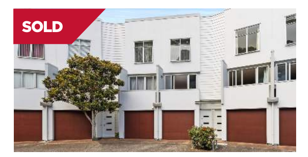
Mount Eden/Auckland 23/852 Mount Eden Road