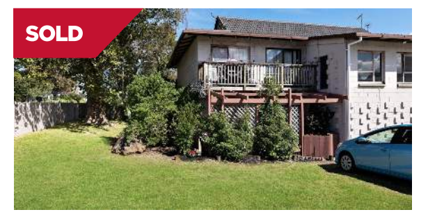
Mount Albert/Auckland 15/697 New North Road

Priced to sell, this sunny terraced townhouse near Mt Eden Village features tandem garaging and a private west-facing courtyard, perfect for late-day sun.