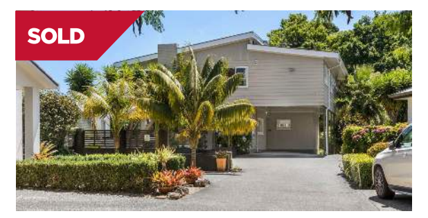
Mount Albert/Auckland 78 Linwood Avenue