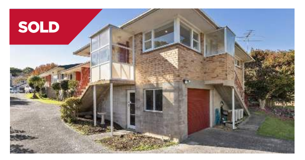
Mount Eden/Auckland 4/8 Fairview Road

Great value on a prime Auckland arterial route! This renovated two-bedroom unit features two courtyards, a carport, off-street parking, and an affordable path to homeownership.