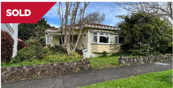
Epsom/Auckland 13 Ferryhill Road

This seven-bedroom property, comprising two dwellings, offers over $1,600 weekly potential income. Freshly painted, insulated, and spanning ~188sqm, it's ideal for redevelopment or renovation.