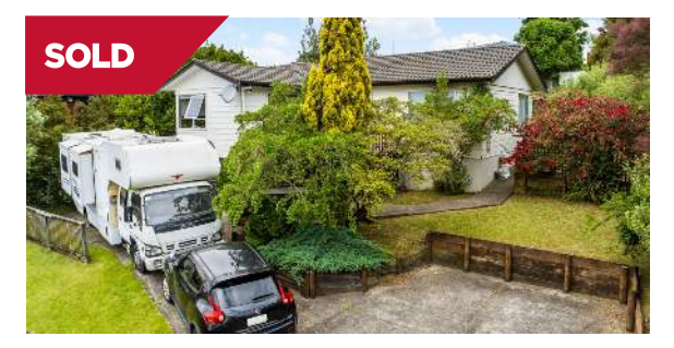
Titirangi/Auckland 14A Pokapu Street

Located near Chamberlain Golf Course's ninth hole and surrounded by multi-million dollar homes, this freshly painted six-bedroom, two-level home is a rare "monster cash cow" opportunity.