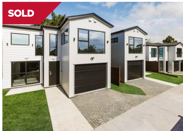
Manurewa 4/16 Smedley Street