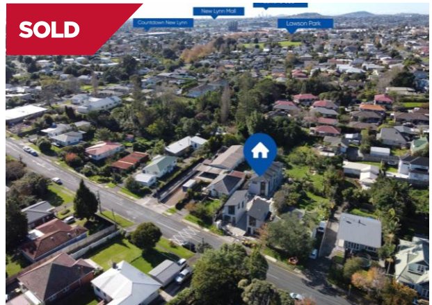
New Lynn 3/54 Park Avenue