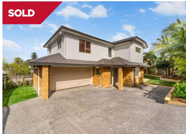
New Lynn 12A Links Road