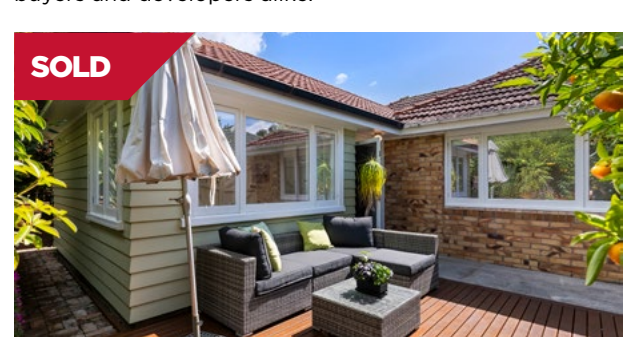
Waterview/Auckland 13 Seaside Avenue

Situated on a full site of 725sqm, more or less, and zoned Mixed Housing Suburban, this near 'original' brick and tile home provides an exciting blank canvas for first home buyers and developers alike.