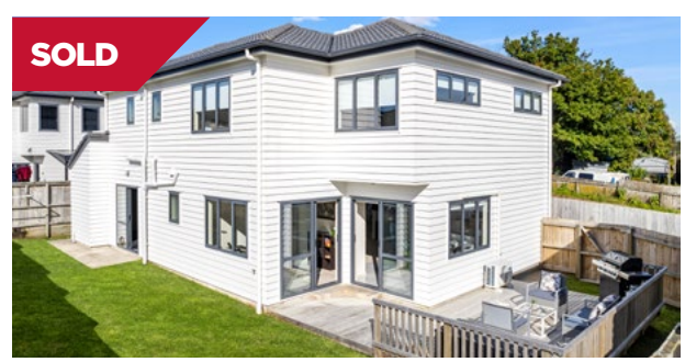
Mangere East/Auckland 17C Earlsworth Road

This instantly appealing one level bungalow is a total surprise package. Renovated with a superb sense of style and sheer good taste, its beautiful, restful, open plan cleverly extends to elevated decking.