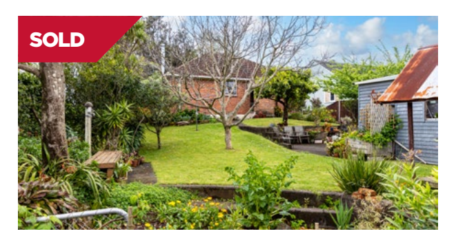
Mount Albert/Auckland 26 Renton Road