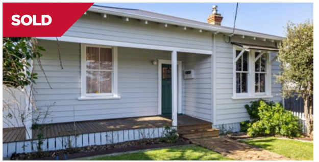
New Lynn/Auckland 1/4 Gardner Avenue