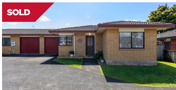
Royal Oak/Auckland 7/861 Manukau Road