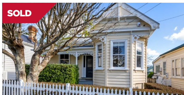
Mount Eden/Auckland 18 Burnley Terrace

Tranquil Scarborough Reserve provides the calm green outlook and adds an x-factor to this charming 1910s villa. Situated just metres to the delights of Parnell Rd's restaurants and cafes, this is a special city-side lifestyle.