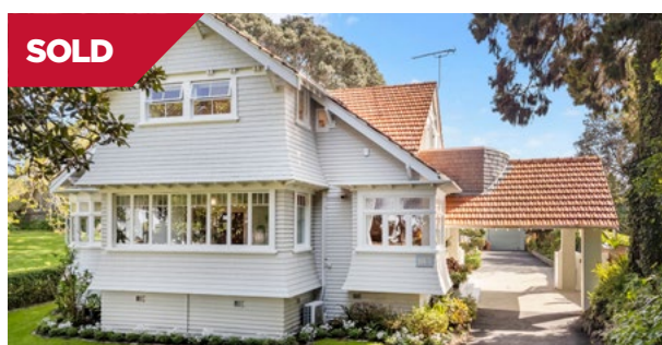
Epsom/Auckland 185 St Andrews Road

Located in sought after Ellerslie School and Remuera Intermediate Zones this warm, light-filled home offers a spacious, open-plan living and dining area that opens to a private deck, patio and a generous garden.