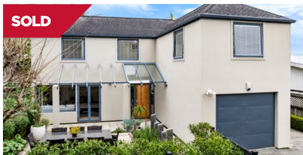
Saint Heliers/Auckland 1A Elizabethan Gardens

Set down a long private driveway, high on the hill with views over the racecourse to One Tree Hill, Mt St John, Mt Eden and Mt Hobson, this spacious family-sized home has a floorplan that provides a range of living options.