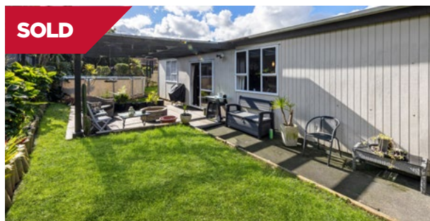
One Tree Hill/Auckland 99A Rockfield Road

Located in this highly regarded cul-de-sac this tastefully presented, freestanding, three bedroom townhouse is just moments to local shops, walking distance to St Heliers School and a short drive to St Heliers waterfront.