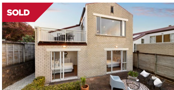
Ellerslie/Auckland 1/6 Pukerangi Crescent

Set in arguably Stonefield's finest street, at the base of Mt Wellington, you'll find a sense of space, openness and a park-like feel that's a rarity.