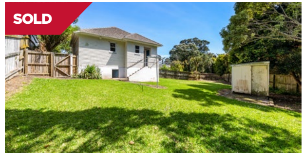
Remuera/Auckland 34 Ara Street

Located just off Victoria Ave in the heart of Remuera's Grammar zoned northern slopes, this stand-alone, Carnachan designed, road frontage townhouse really is the ideal lock-up and leave apartment alternative.