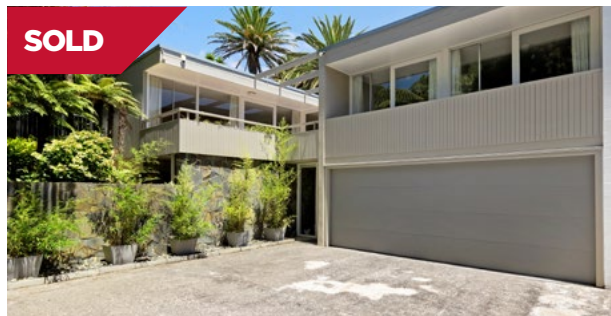
Saint Heliers/Auckland 1/5 Hampton Drive

This two bedroom, weatherboard, ex-state house is located at the end of a quiet, central northern slopes street. The orientation is east west facing. Needless to say it is an opportunity with unlimited potential.