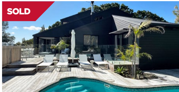
Te Arai/Rodney 267 School Road

Overlooking neighbouring Churchill Park from a quiet no-exit street, the flexible floorplan includes four bedrooms with the option to use one as a second living area. Spacious open plan living extends out to decks.