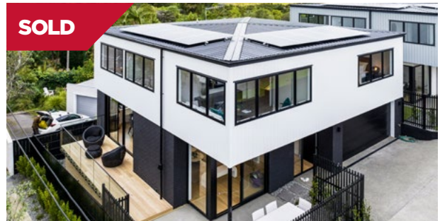
Glendowie/Auckland 15A Kinsale Avenue

Constructed in cedar and rendered brick, this generous upbeat floorplan features spacious living throughout. Flooded with abundant sunlight, it is set in a low maintenance garden with synthetic turf for easy care.