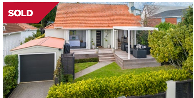
Orakei/Auckland 122 Reihana Street

An exceptional opportunity awaits with this expansive property, spread across two titles, this sizable rectangular section of 1426sqm, more or less is a rarity. Zoned Mixed Housing Suburban, it offers a blank canvas.