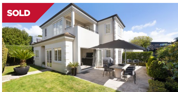
Orakei/Auckland 26A Rautara Street

Set back off the road, enjoying a splendid sense of seclusion, this resort style residence of over 500sqm has that far away feeling.