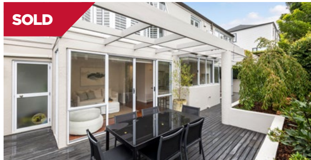
Remuera/Auckland 6 Hiriri Avenue