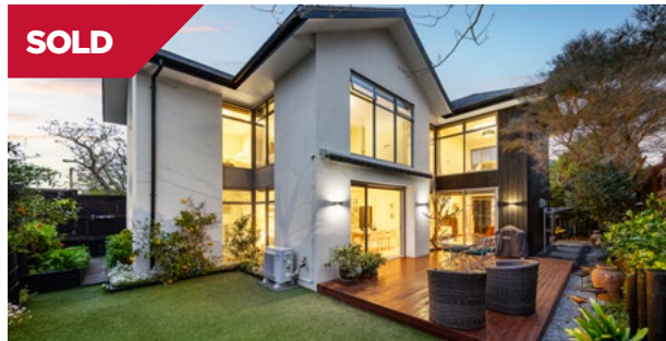
Kohimarama/Auckland 121A Kohimarama Road