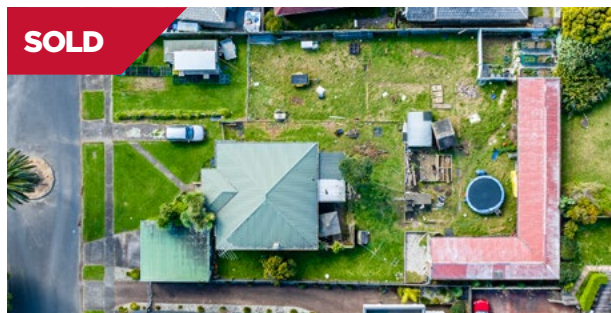
Ellerslie/Auckland 3 & 3A Lonsdale Avenue

Brand new, constructed in timber and concrete, and offered with secure internal access garaging, these 'high spec'd' terraced homes are the perfect solution for those looking to downsize and keep a property 'in town'.