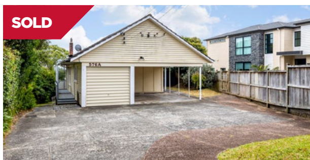
SOLD Remuera/Auckland 1/576A Remuera Road

This elevated two or three bedroom unit is a must see. The charm of its 50s heritage has been modernised with a crisp white kitchen, separate laundry and a luxurious fully tiled bathroom.