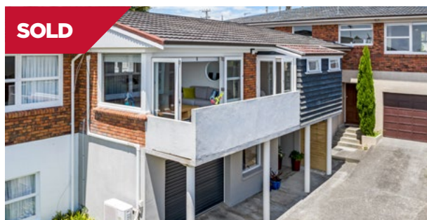
SOLD Takapuna/Auckland 2/4 Beacholm Road

Conveniently located just a stone's throw to the Village, this delightful, 1910, weatherboard villa enjoys an incredibly tranquil ambiance on its charming treelined street.