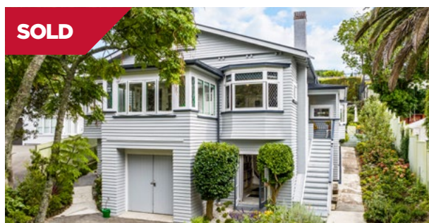
SOLD Remuera/Auckland 15 Mahoe Avenue

This Double Grammar zoned unit is a complete do up. The living is open plan, there's two cozy bedrooms and a private outdoor living area perfect for entertaining guests.