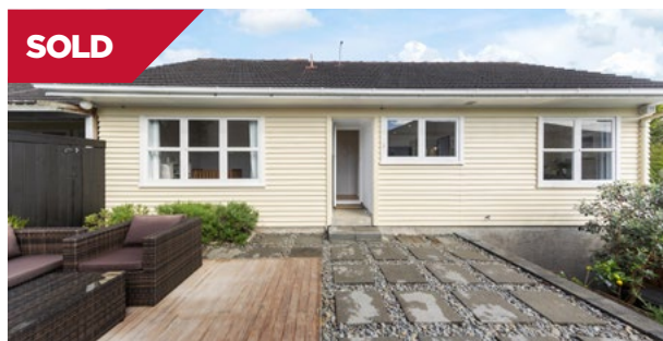
SOLD Remuera/Auckland 2/576A Remuera Road

Hidden well off the road with security gate and double garage, the elevation and privacy is hugely appealing. This fabulous, refurbished home has a relaxed open plan that connects to the outdoors beautifully.