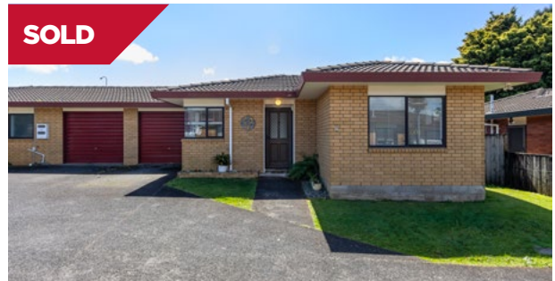
Royal Oak/Auckland 7/861 Manukau Road