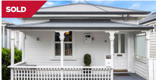
Parnell/Auckland 10 Scarborough Terrace