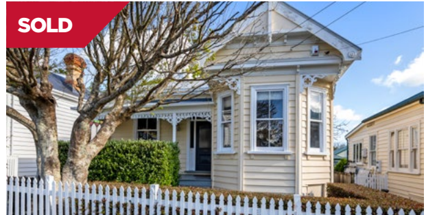
Mount Eden/Auckland 18 Burnley Terrace

Tranquil Scarborough Reserve provides the calm green outlook and adds an x-factor to this charming 1910s villa. Situated just metres to the delights of Parnell Rd's restaurants and cafes, this is a special city-side lifestyle.