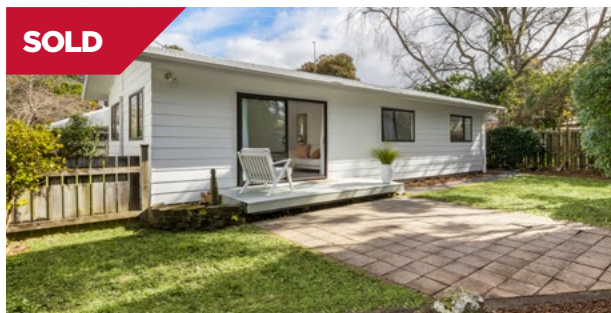
One Tree Hill/Auckland 7A Ewenson Avenue

This freehold, immaculately presented brick unit is a perfect find for those seeking a warm, sunny, secure, private retreat. Located in a quiet enclave, it offers a peaceful neighborhood feel.