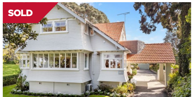
Epsom/Auckland 185 St Andrews Road

Located in sought after Ellerslie School and Remuera Intermediate Zones this warm, light-filled home offers a spacious, open-plan living and dining area that opens to a private deck, patio and a generous garden.