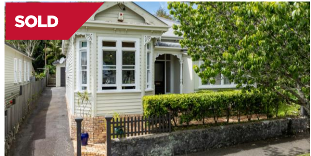
Mount Eden/Auckland 78 Esplanade Road

With its charming character, excellent condition, and convenient location, this property is ideal for families, professionals, or anyone seeking a well-rounded home with plenty of space and lifestyle benefits.