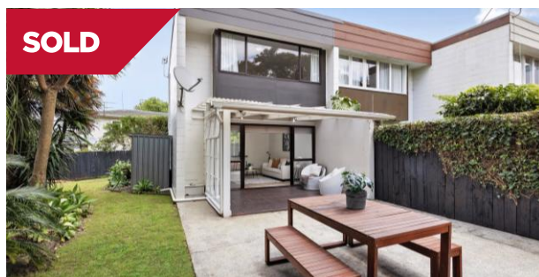
Ponsonby/Auckland 37 Brown Street

Perfect for first-time buyers or those seeking an easy-care home, this unit features character timber floors, a modern kitchen, a luxurious bathroom, and a sun-filled courtyard for alfresco dining.