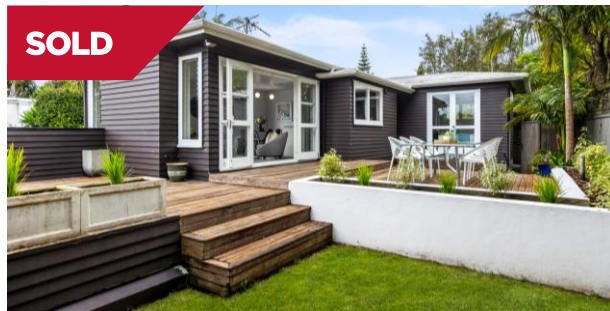
Epsom/Auckland 232A St Andrews Road

The main residence features a cozy lounge with a bay window, three spacious bedrooms, two bathrooms, and an open-plan kitchen/dining area that flows seamlessly to a private deck, perfect for outdoor relaxation.