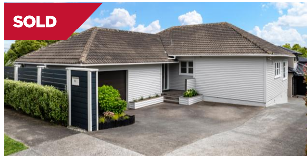
Three Kings/Auckland 62 Duke Street