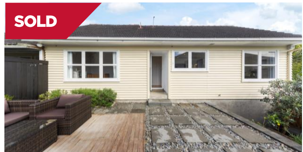
Remuera/Auckland 2/576A Remuera Road

Nestled off the road with a security gate, this home offers privacy, a spacious layout, and easy access to Cornwall Park, shopping, and motorway links.