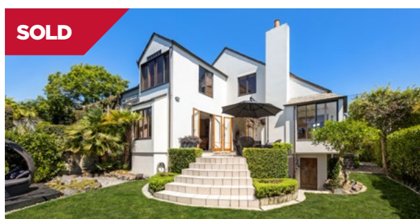
Remuera/Auckland 4 Mamie Street

This instantly appealing, meticulously renovated, villa is a statement in uncompromised family living. The generously proportioned floorplan features with high ceilings and upbeat modern design detail.