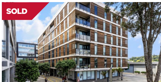
Grafton/Auckland 505/8 Nugent Street

Being positioned up off the road provides a sunsoaked tranquil setting for this stylish and practical 1970s terraced home. Constructed in permanent materials, it is one of only four units.