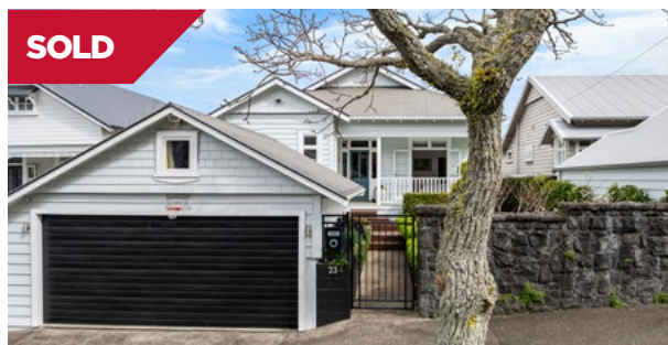
Mount Eden/Auckland 23 Disraeli Street

Situated in the Auckland Grammar School Zone, right on the Mt Eden border, here's brilliant, stylish, city-side, pet-friendly, lock-up and leave living with entertainment options on the doorstep.