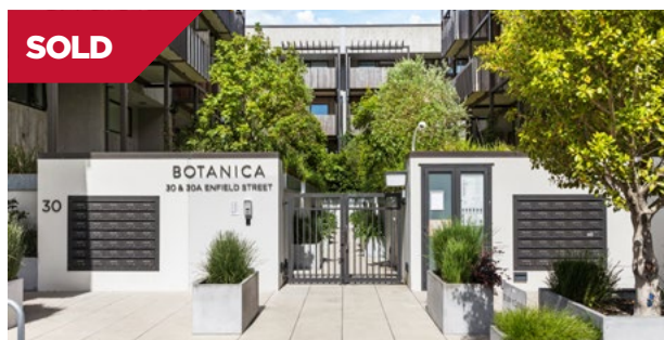
Mount Eden/Auckland 301/30A Enfield Street