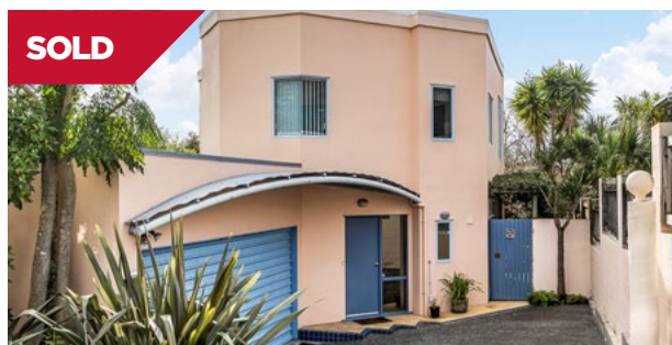
Herne Bay/Auckland 23A Emmett Street