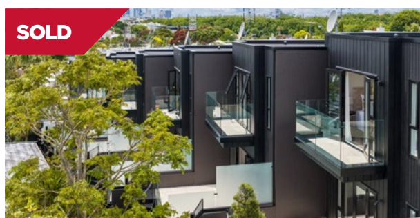
Westmere/Auckland 39B Garnet Road

Pretty as a picture, this iconic square front villa has a charm all of its own. Located in a premium position, just a short stroll to Ponsonby Rd, with its selection of shops, cafes and restaurants just moments away.