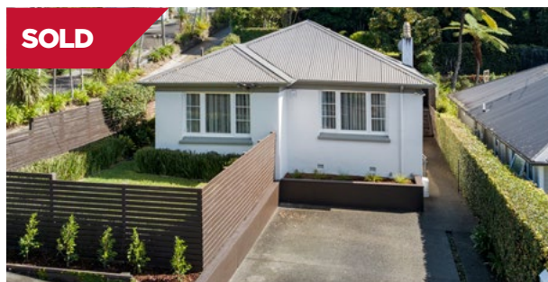
Westmere/Auckland 17 Larchwood Avenue

Set back from the road, a short stroll to Madills Farm, this 1970s family home sits within a secure fully fenced and gated garden area that offers plenty of room for a growing family to enjoy.