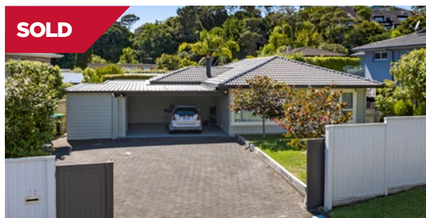
Saint Heliers/Auckland 59 Grampain Road

Experience the ultimate Grey Lynn lifestyle in this seriously cool, private, elevated, traditional villa, lovingly maintained by the current owners for over 22 years. This home is perfect for families seeking comfort and style.