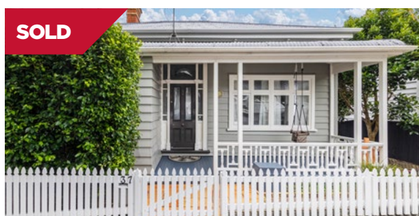
Ponsonby/Auckland 37 Brown Street

Experience ideal urban living in one of the most sought-after neighbourhoods in this "cute as a button" 1940s bungalow. Its chic, white-washed plaster over brick exterior immediately catches the eye.