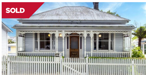
Grey Lynn/Auckland 16 Hakanoa Street