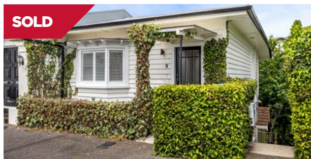
Saint Marys Bay/Auckland 9 Swift Avenue

This is a unique opportunity to secure a character-filled home in this premium location. There is the option to purchase either one, or both 7 and 9 together, as properties such as these rarely become available.