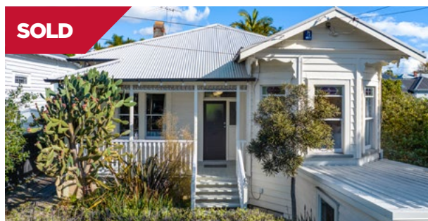
Grey Lynn/Auckland 26 Beaconsfield Street

Nestled towards the top of the highly sought-after Hakanoa St, this cherished villa is now available as a deceased estate, offering a rare opportunity for discerning buyers.