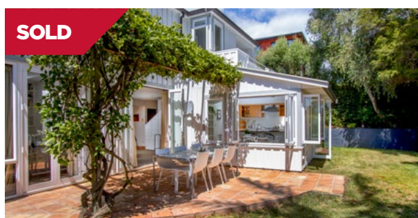
Westmere/Auckland 32A Livingstone Street

This appealing home is private from the road and welcomes you through a gated, courtyard entrance into a light, contemporary open plan. Cleverly re-designed, it went through a substantial reconstruction in 2013.