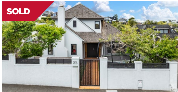
Kohimarama/Auckland 22 Sage Road