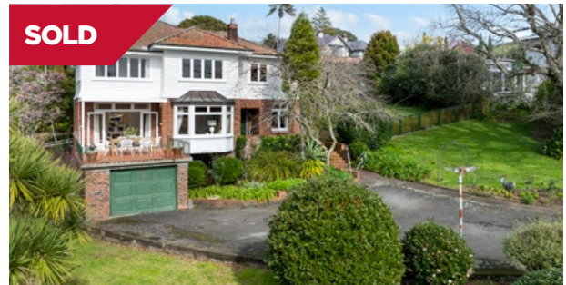
Remuera/Auckland 63 Portland Road

This architectural redesign is a testament to transformation. Originally built in the 60s, the property looks over to beautiful native bush, enjoying the abundance of native birdlife that fills the area.