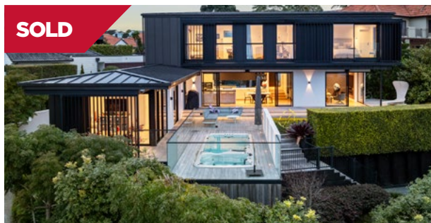
Orakei/Auckland 8 Puna Street

Stately, enduring and timeless, such are the characteristics of this imposing brick and weatherboard two storey residence on a substantial plot of 1,260sqm, more or less, of freehold land.