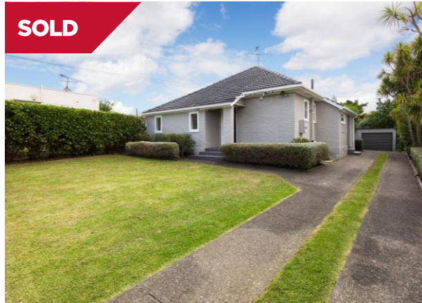
Greenlane 11 Cadman Avenue $1,260,000