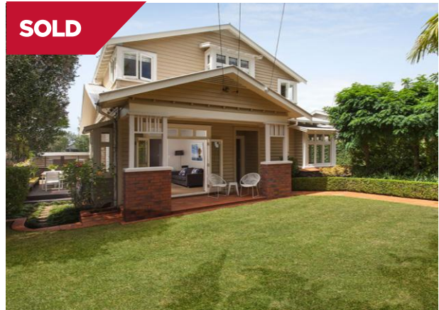
Greenlane 9 Korokino Road