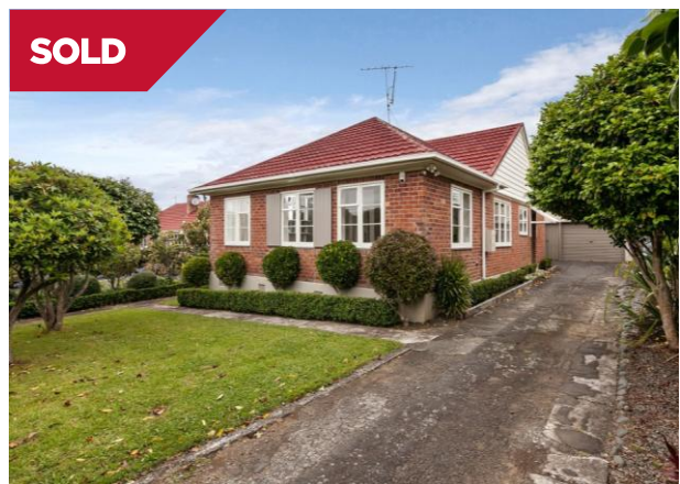
Greenlane 9 Ferguson Avenue $1,210,000