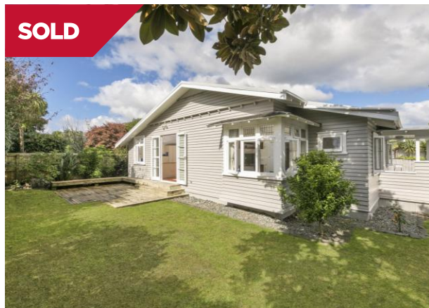
Mount Eden 18 Waitomo Avenue $1,227,000