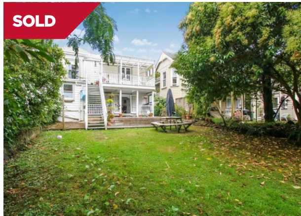
Mount Eden 39 Wynyard Road $1,607,500