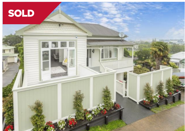
Ellerslie 20 Amy Street $1,685,000