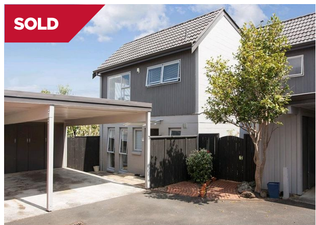
Ellerslie 7/12 Pukerangi Crescent $685,000