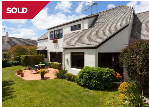
Greenlane 27a Wheturangi Road $1,139,000