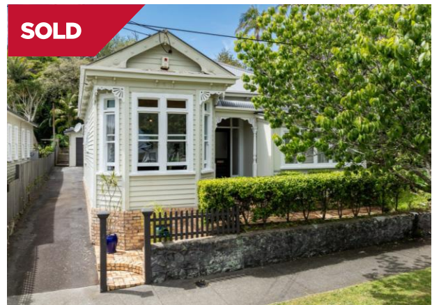
Mount Eden 78 Esplanade Road