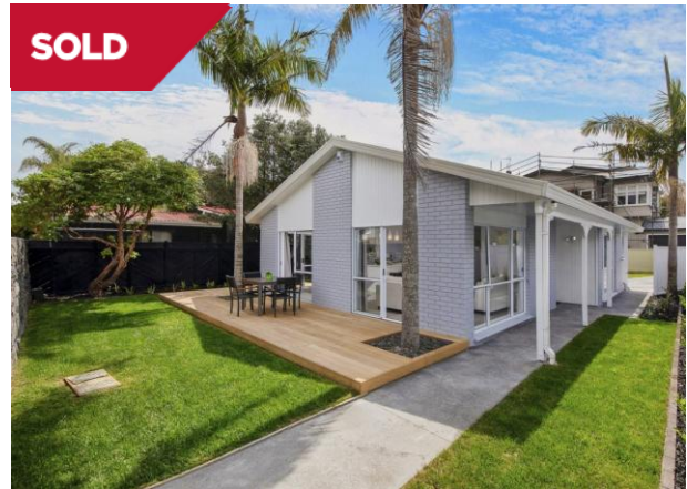
Mount Eden 29A Marsden Avenue $1,200,000