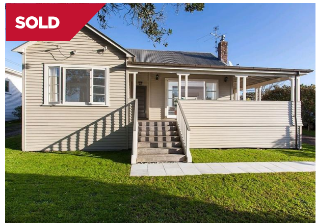
Mount Eden 60 Landscape Road $1,510,000