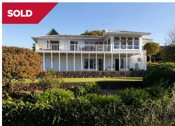
Ellerslie 3 Malabar Drive $1,130,000