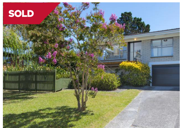
Milford 2 & 3, 38a Seaview Road