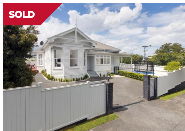
Mount Eden 55 The Drive $2,050,000