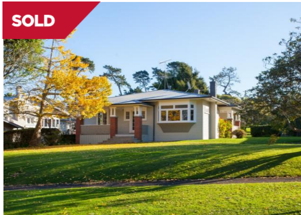
Greenlane 49 Maungakiekie Avenue $3,820,000