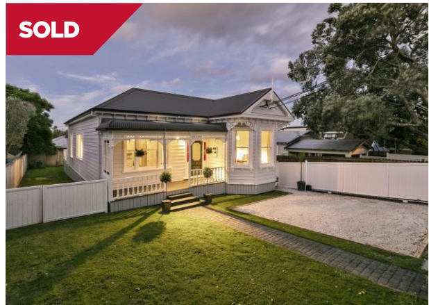
Greenlane 71 Wheturangi Road $2,100,000