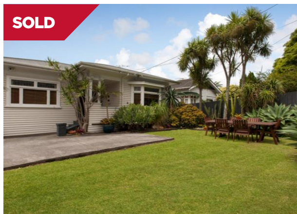
Greenlane 261 Campbell Road $965,000