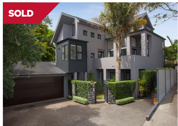
1Mount Eden 4A Peary Road $1,280,000