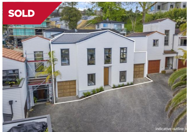
Remuera Unit 1, 2, 3, 576a Remuera Road $3,000,000