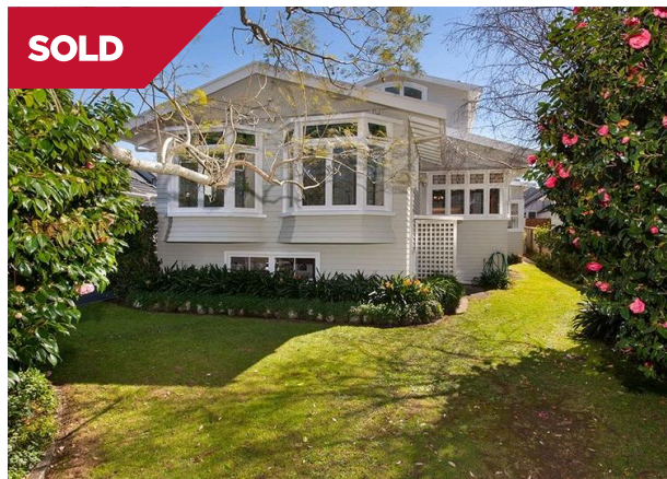
Greenlane 8 Iirangi Road $1,571,000