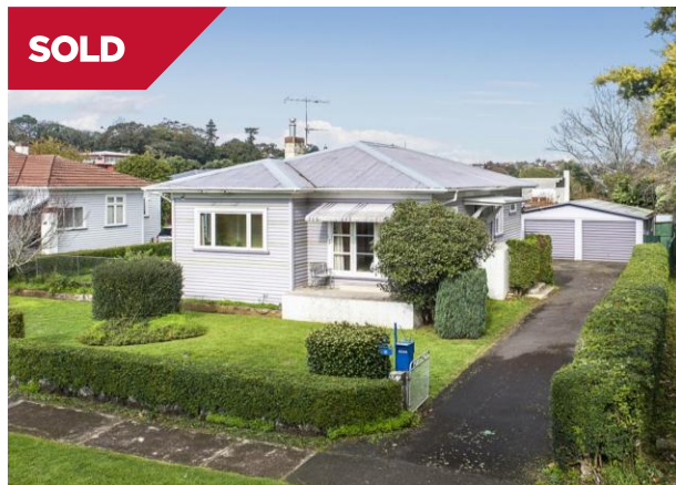
Mount Eden 25 Kings Road $1,300,000