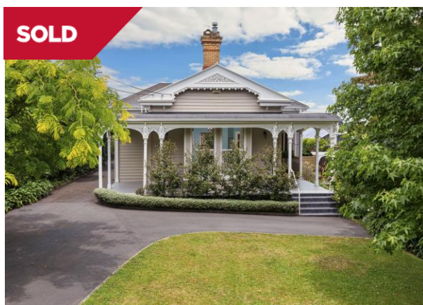
Mount Eden 82 Ranfurly Road $3,080,000