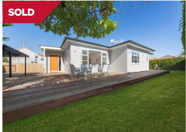
Greenlane 5 William Avenue $1,520,000