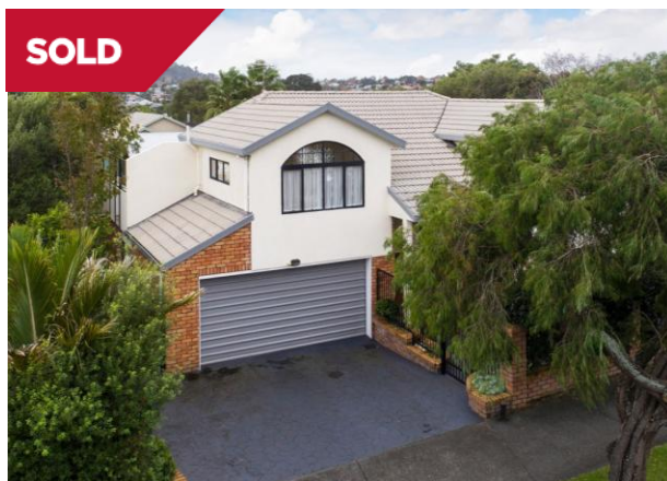
Mount Eden 109 Landscape Road $1,180,000