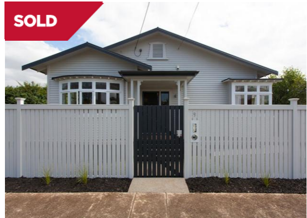
Mount Eden 9 Princes Avenue $1,620,000