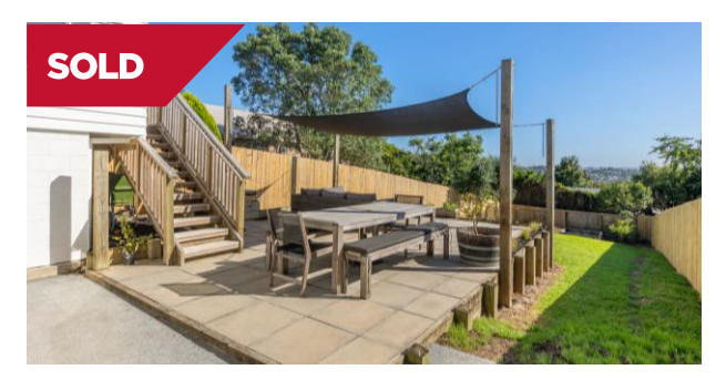
Massey/Auckland 1/203 Waimumu Road