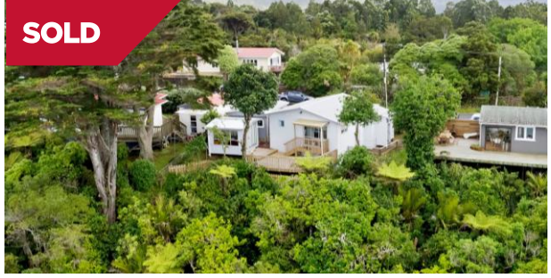
Laingholm/Auckland 65 Tane Road