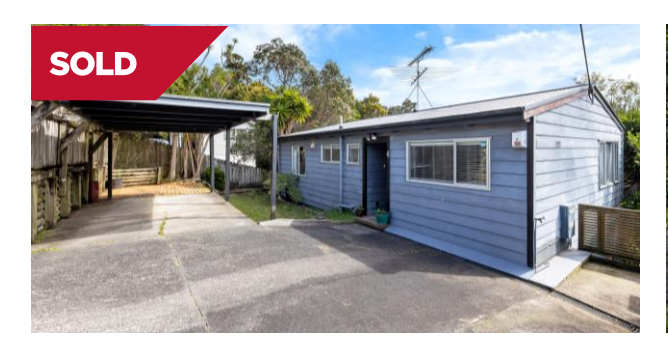
Titirangi/Auckland 4/191 Titirangi Road