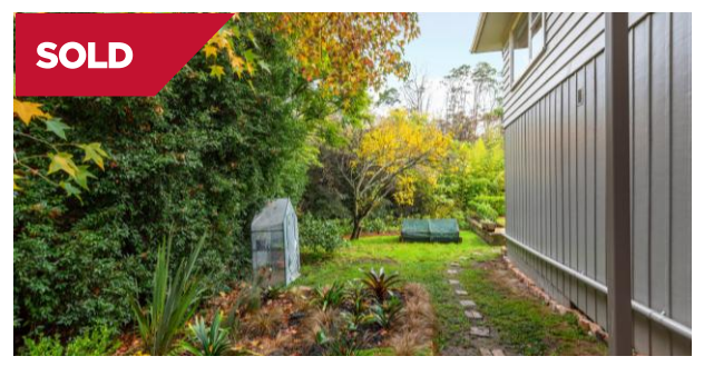
Avondale/Auckland 16 Amsterdam Place