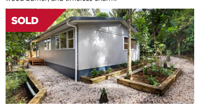
Titirangi/Auckland 47 Wood Bay Road

Living and dining areas flow to a west-facing deck, offering stunning sunset views, seamless indoor-outdoor living, and access to over 3500sqm (more or less) of land with beautiful native trees and lush greenery.