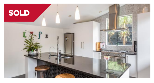
Greenhithe/Auckland 15 Oakford Park Crescent

Featuring a modern kitchen and bathroom, spacious living areas, a private courtyard for entertaining, and secure internal-access double garaging, this home offers comfort and practicality for relaxed living.