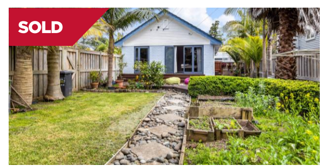
St Heliers/Auckland 59 Grampain Road

Conveniently located near schools, amenities, and public transport, this home is ideal for buyers seeking a solid investment with excellent potential to add value.