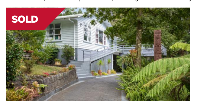
Titirangi/Auckland 127 Konini Road

Escape city life with this quintessential Kiwi lifestyle property, offering over 6.2 hectares (more or less) of serene land, lush lawns, and mature bush surrounds, just 40km from Auckland city centre.