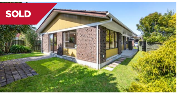
Henderson/Auckland 2/35 Ti Nana Crescent