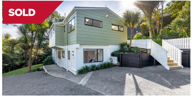
Glen Eden/Auckland 5 Autumn Avenue

3 □ 1 □ 1 □ 2 □ 2 □ 489<sub>sqm</sub> □ 4 □ 1 □ 2 □ 6 □ 3536<sub>sqm</sub> □