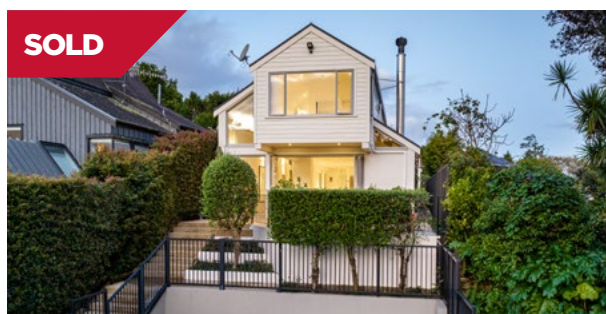
Parnell/Auckland 109 Brighton Road

This gorgeous charming completely done up, sunny, three double bedroom weatherboard bungalow on a lovely flat fully fenced and gated easy-care section has a great feel throughout.