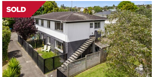
SOLD Meadowbank/Auckland 2/31 Gowing Drive

This freestanding, 1980s, brick and tile home provides easy single level living - perfect for first home buyers, downsizers or investors. Well presented and situated in a quiet enclave, the property is set back from the road.