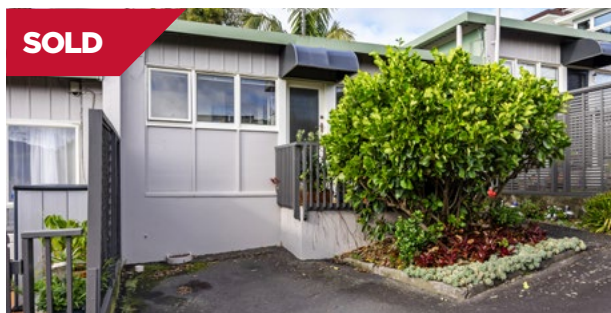
Meadowbank/Auckland 2/146 St Johns Road

This freestanding brick home offers single level living at its best, low maintenance and ideal for first home buyers, investors or those looking to downsize. Located within walking distance to Royal Oak Shops and Cornwall Park.