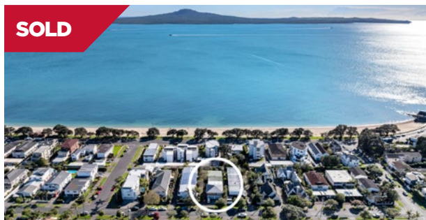
SOLD Kohimarama/Auckland 1-4/32 Speight Road

Private, quiet and full of natural light, this conveniently located 'lock-up and leave' presents itself as an ideal entry point to the property market or easy care investment.