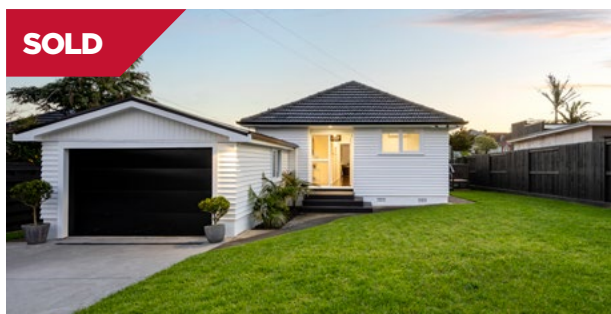
Glen Innes/Auckland 3 Weybridge Crescent