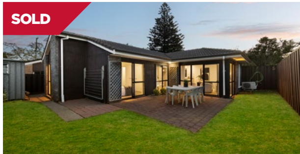
SOLD Onehunga/Auckland 110C Grey Street