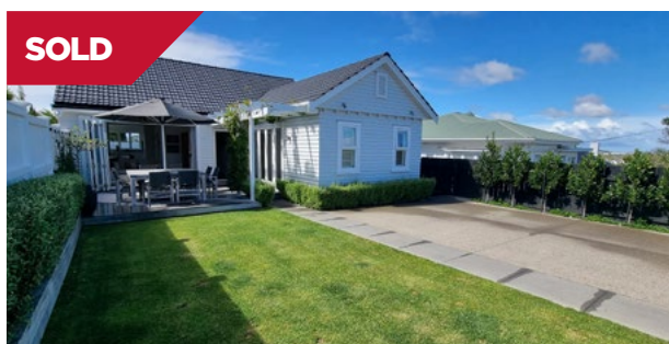
Remuera/Auckland 56 Koraha Street

Timeless elegance combines here with gorgeous modern functionality in this stunning early 1900s villa. Situated on a freehold site, it has been meticulously renovated and extended overtime.