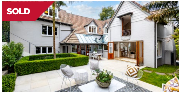
SOLD Remuera/Auckland 26 Crocus Place

This well-presented upstairs unit in a prime road-front position offers an excellent opportunity for investors or first home buyers eager to secure a smart entry into a convenient location.