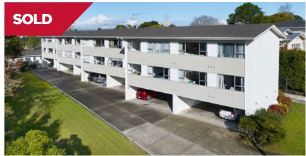
SOLD Ellerslie/Auckland 11/46 Amy Street

This cleverly conceived substantial predominately masonry home is full of light and practical family living and sits in splendid seclusion at the end of a quiet cul-de-sac.