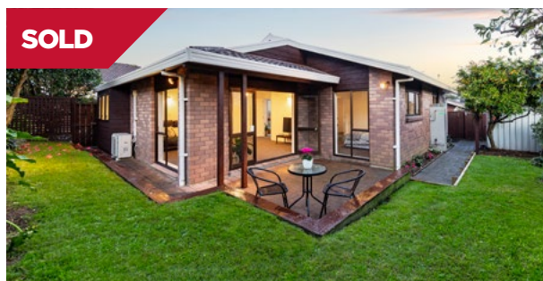
Royal Oak/Auckland 3/48 Turama Road

This charming, 1950s, weatherboard home has Mixed Housing Urban zoning. Its roadside presence is instantly appealing as is a level site, perfect for children, pets, or potential development.