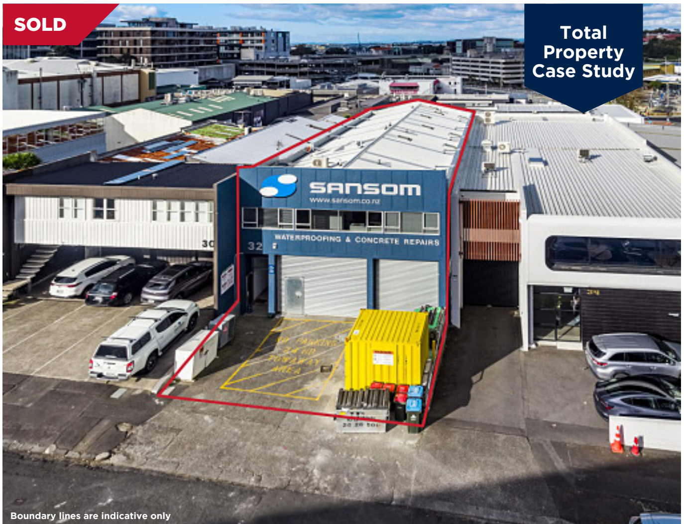
Boundary lines are indicative only