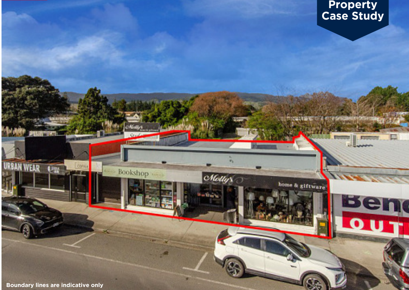
Boundary lines are indicative only