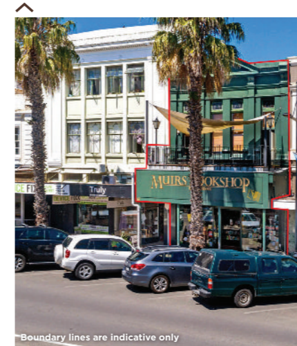
Boundary lines are indicative only

levels and occupies a 373sqm site, with rear access and off-street parking. (Mike Florance, Bayleys Gisborne)