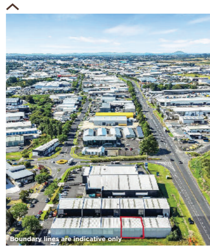
Boundary lines are indicative only

completed development has sold with vacant possession for $495,000. The architecturally designed unit is one of 10 within a boutique, security-controlled complex, providing high-stud warehousing and functional amenities. Positioned in a low-vacancy industrial precinct near Pukete and the established Te Rapa hub, the property benefits from access to the State Highway network. (Travis Cashmore, Darren Anderson, Bayleys Hamilton)