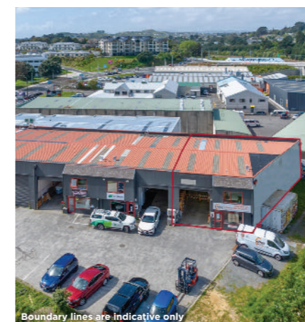
Boundary lines are indicative only